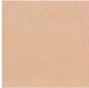
0034 LIGHT PEACH CREAM