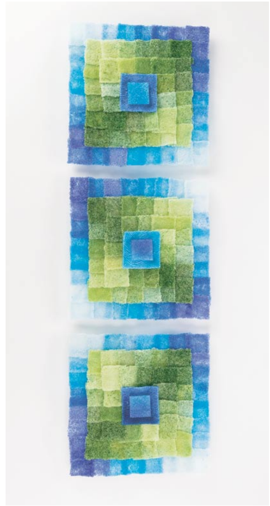
SUSAN LONGINI, “PIECED QUILT TRIPTYCH,” 2005. PÂTE DE VERRE, 36 X 11 X 2 IN (91 X 28 X 5 CM) INSTALLED.

LONGINI FIRED HER TINTED COMPONENTS TO A LOW TEMPERATURE, RETAINING A DELICATE, GRANULAR APPEARANCE.