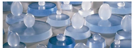
STEVEN EASTON, “SNOW QUEEN’S REALM II” (DETAIL), 2005. PÂTE DE VERRE, 5 X 36 X 84 IN (13 X 91 X 213 CM) INSTALLED.

LONGINI FIRED HER TINTED COMPONENTS TO A LOW TEMPERATURE, RETAINING A DELICATE, GRANULAR APPEARANCE.